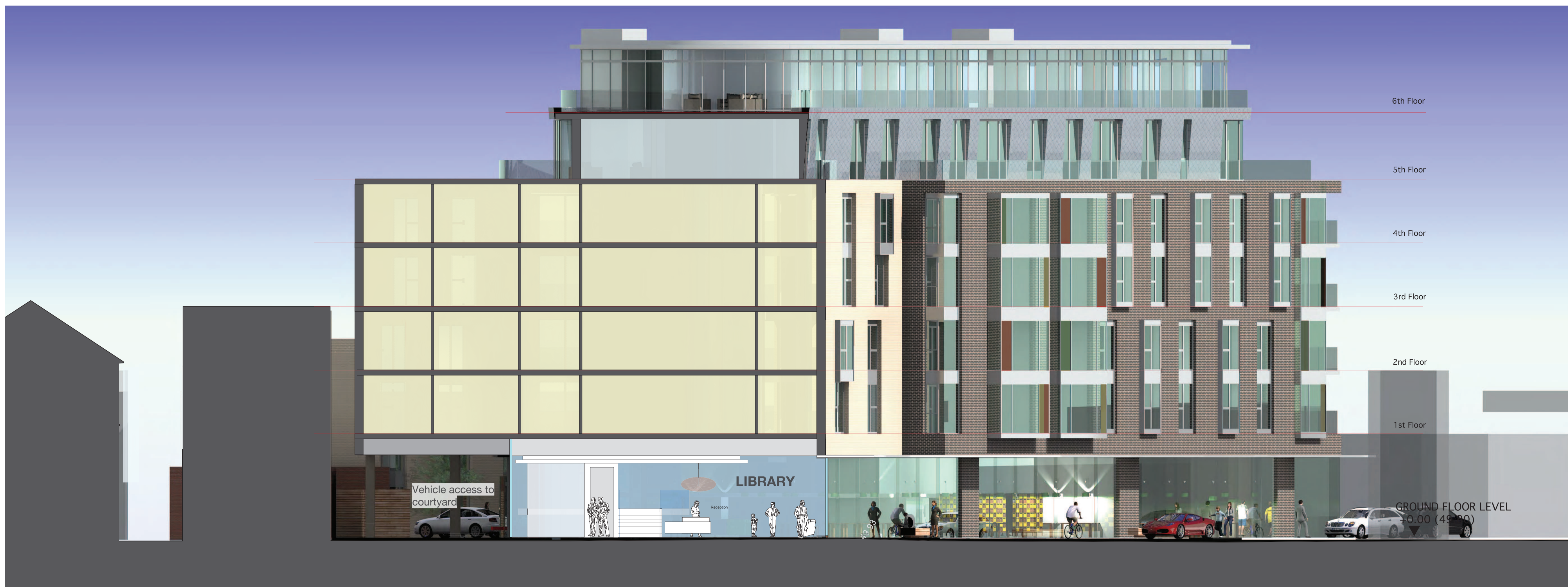
Proposed Section C-C - Scale 1:100@A1